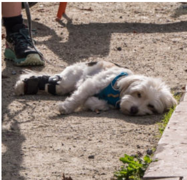
Back to Bregenz, everyone was tired but also really happy.

The second day took us to Konstanz and Kreuzlingen. We particularly looked forward to the stop-overs where we were served delicious snacks and beverages by smiling faces.