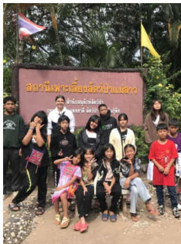
Above right: Teaching English

But other games, such as ball sports or catching, are also very popular among children. In general, the children mostly played outside, they were only playing indoors when there was heavy rain or in the evening when it was dark. Playing with the children made up most of my stay.