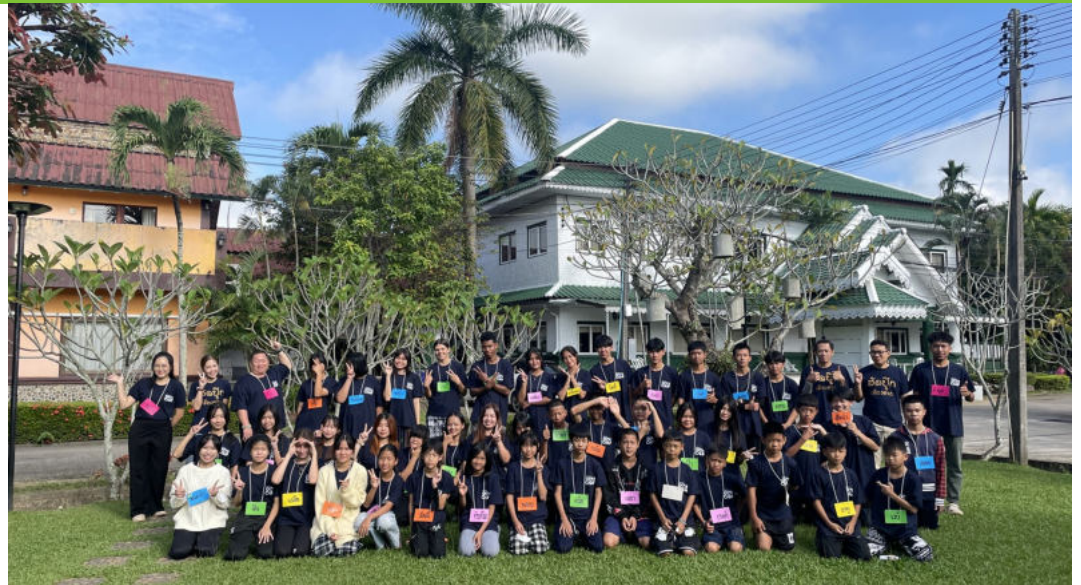
Above: all children attending the OCS-Camp 2023