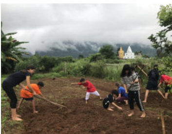
Below: Garden work and making Adobe bricks