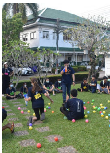
Above: Through different games children learn to get to know each other better

Families receive the opportunity for training and financial support for business ideas that help them save money and earn additional income.