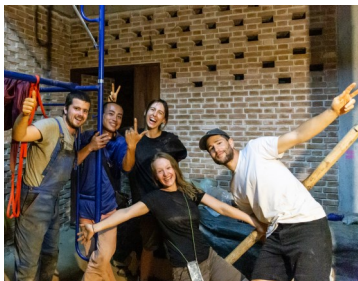
Below: good atmosphere at the construction site

The materials of bamboo, clay, wood, and brick created a beautiful warm atmosphere in the interior and this provides an immediate feel-good character.