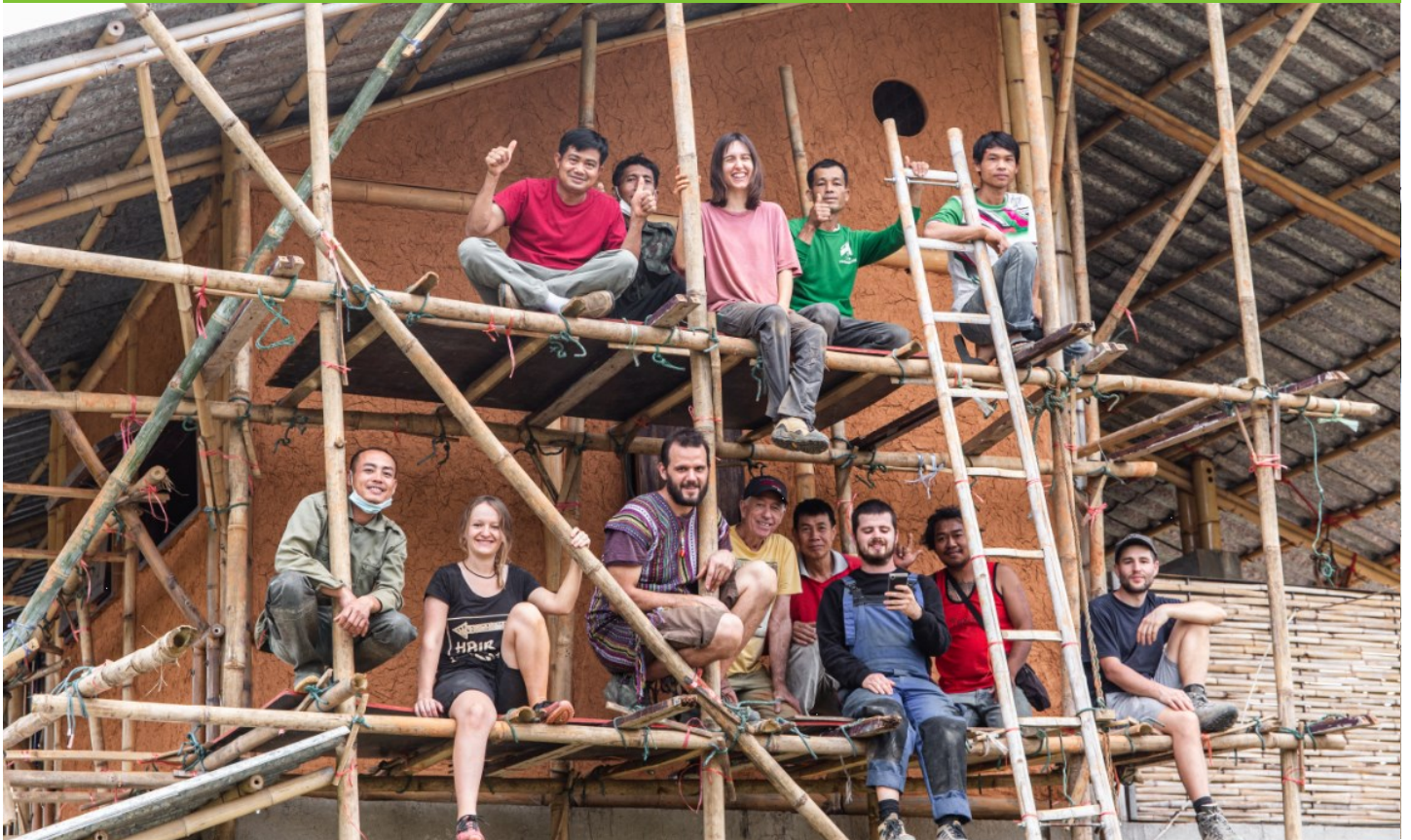
Above: Cooperation of BASEhabitat and our local construction team