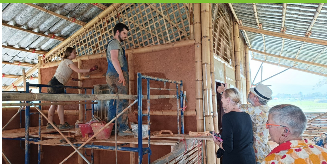
Above: the first inspection of the construction site