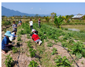
Children weeding and harvesting the vegetables