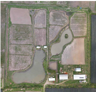
Below: Our organic farm from above and the mountain view at the pond