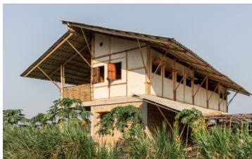
Above and below right: Constructing with bamboo and clay