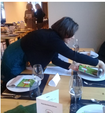
Preparations for the Charity Dinner