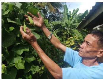
Above: A family from the family support program