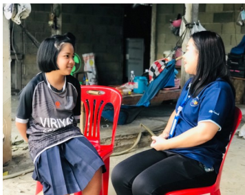
Above and left: Ae during home visits