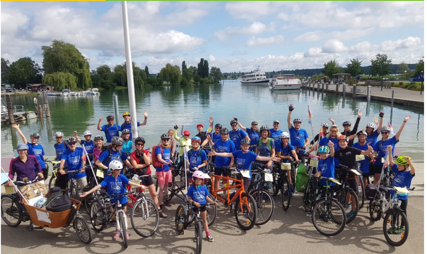
Above: In the harbour of Kreuzlingen/Switzerland