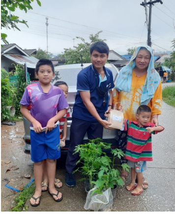
Archa gives plants and seeds to a family