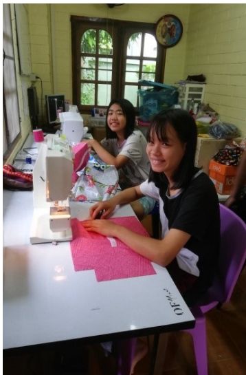
During the production of lunchbags.