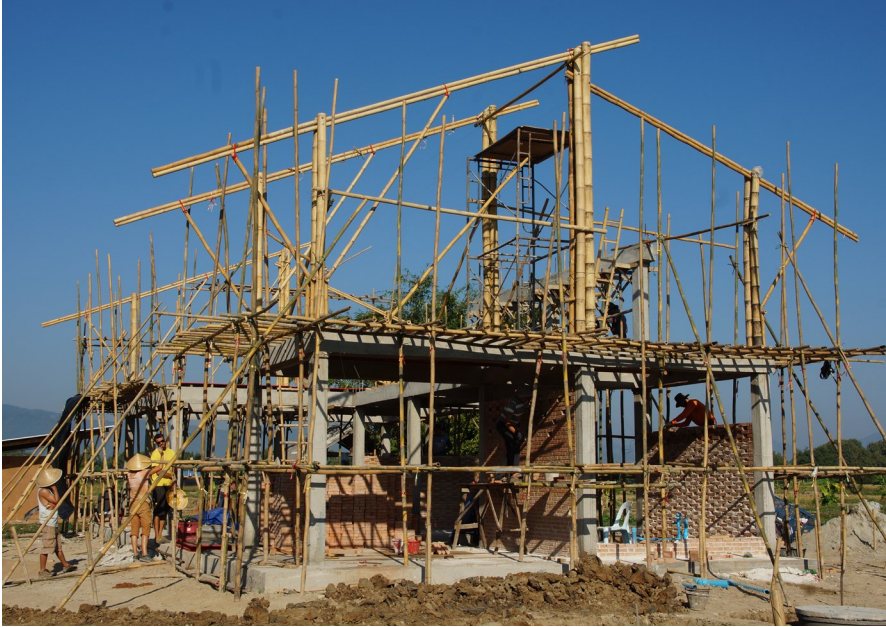
The house is taking on forms