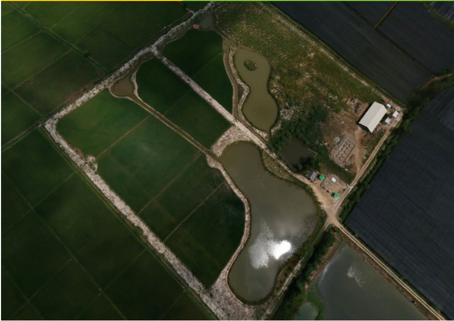
The permaculture field from above