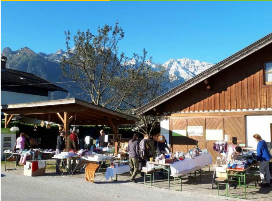
A flea market benefitting BAAN DOI