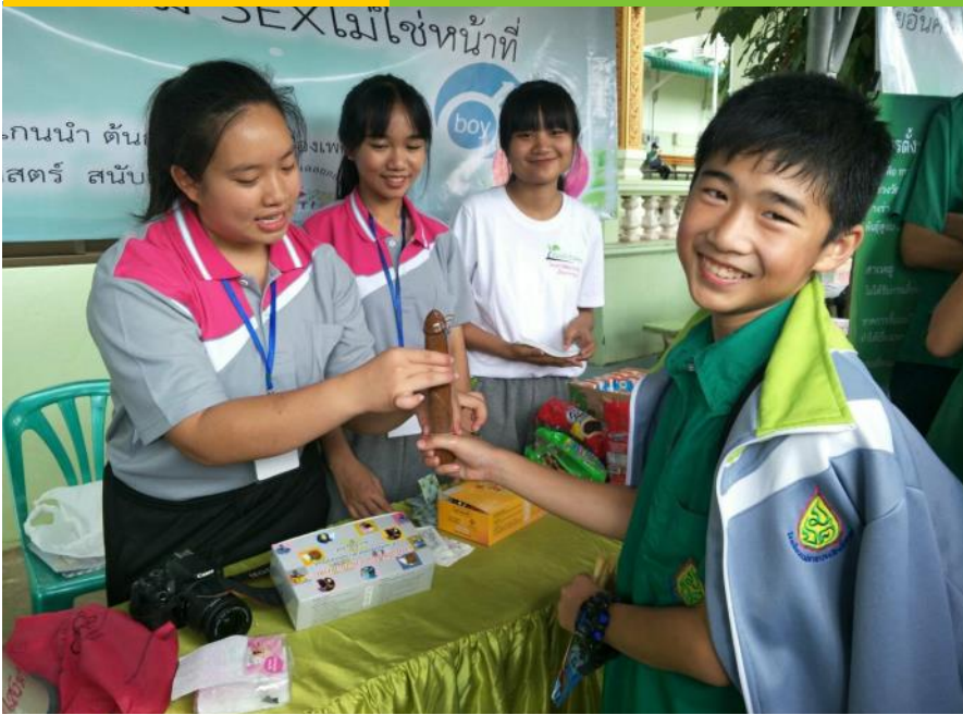
Students doing prevention work supported by BAAN DOI at their school