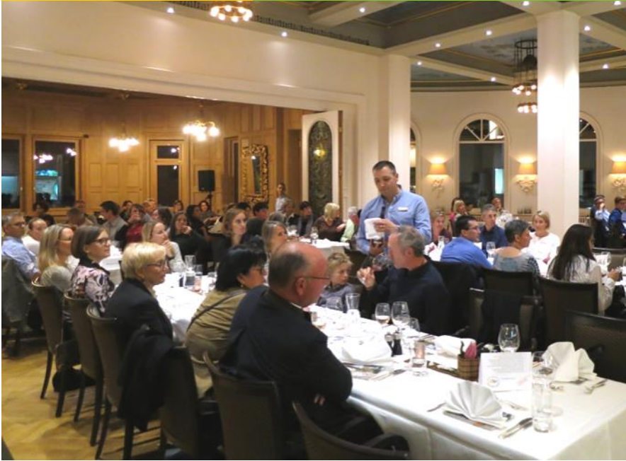
Charity Dinner in St. Moritz, Switzerland