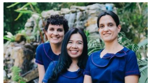
The BAAN DOI Management Team